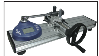
Testing TTC with Internal Sensor