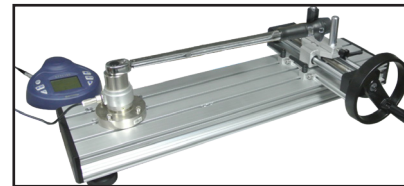
Testing TTC with External Sensor