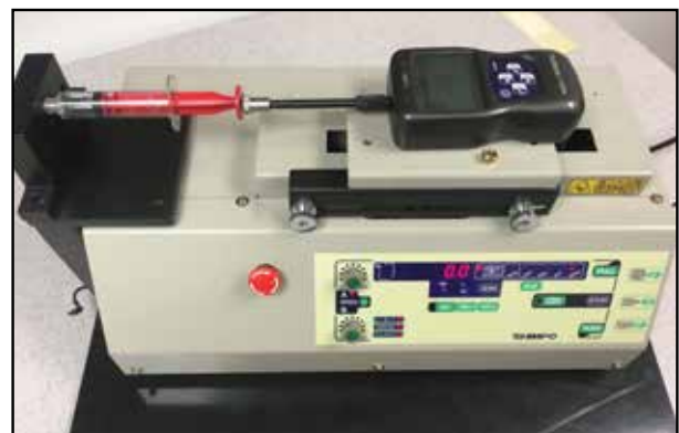
Shimpo Equipment Testing Compression Force on Syringe's Needle