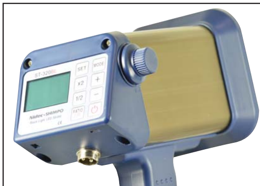
Operation Panel & Flash Adjustment Dial