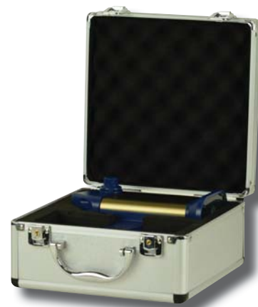
ST-320BL in Included Metal Carrying Case