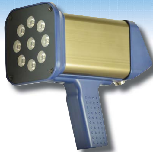
ST-320BL Black Light LED Stroboscope

The ST-320BL is designed for speed and frequency measurements in the printing, packaging, textile, automotive, cable, mining, steel, chemical, optical and medical industries in various applications.