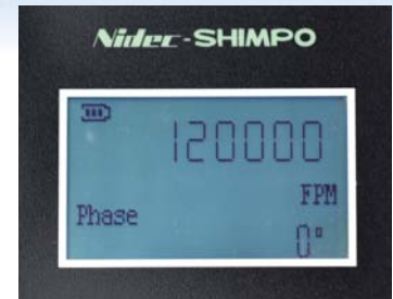
LED Panel Display Close-up