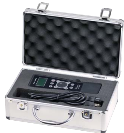
DT-326B in Included Protective Carry Case.