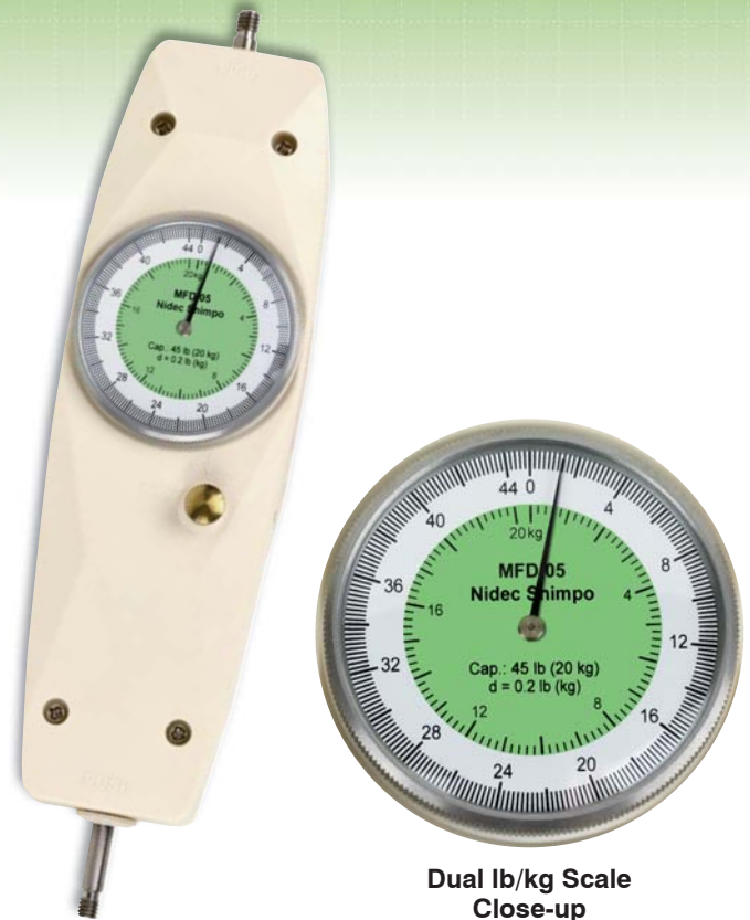
Dual lb/kg Scale Close-up

So simple anyone can use, the economical MFD mechanical force gauges with dual kg/lb scales are excellent for push/pull force testing in manufacturing, material testing, maintenance and inspection applications. The peak force operation mode features an easy push-button reset, especially helpful for repetitive testing in an assembly line or in quality control. The large dial indicator allows viewing of force changes as they occur. This large dial reduces the chance for parallax errors when taking readings. The MFD was ergonomically designed for handheld use, but may also be used with the optional handle-great for loads over 15 pounds (6.8 kg). Due to its mechanical design, response time is immediate. Calibration is achieved by a set of precisely matched springs which are overload protected. All standard Series MFD gauges include a protective carrying case, calibration certificate, plus attachment adapters.