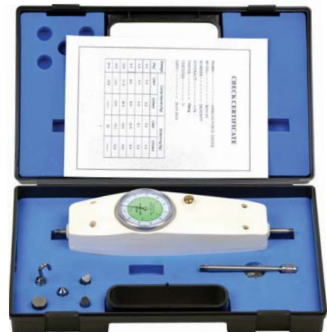
MFD in Standard Carrying Case