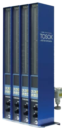
CAG-2000 Shown Stacked in Multiple Columns