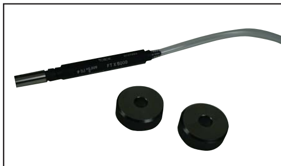
Customized Air Probe Sensor with Maximum & Minimum Calibration Masters. Ordered separately.