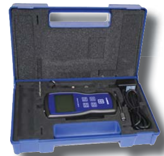
FG-7000 with Accessories in Protective Carrying Case