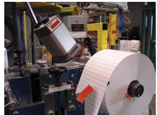
DT-315A Viewing Labeling Machine